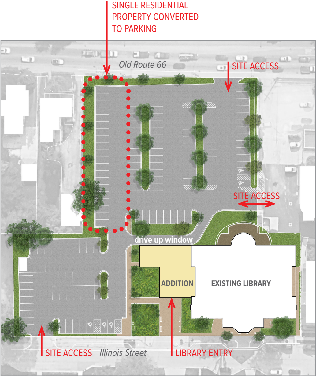
PROPOSED SITE PLAN 127 PARKING SPACES