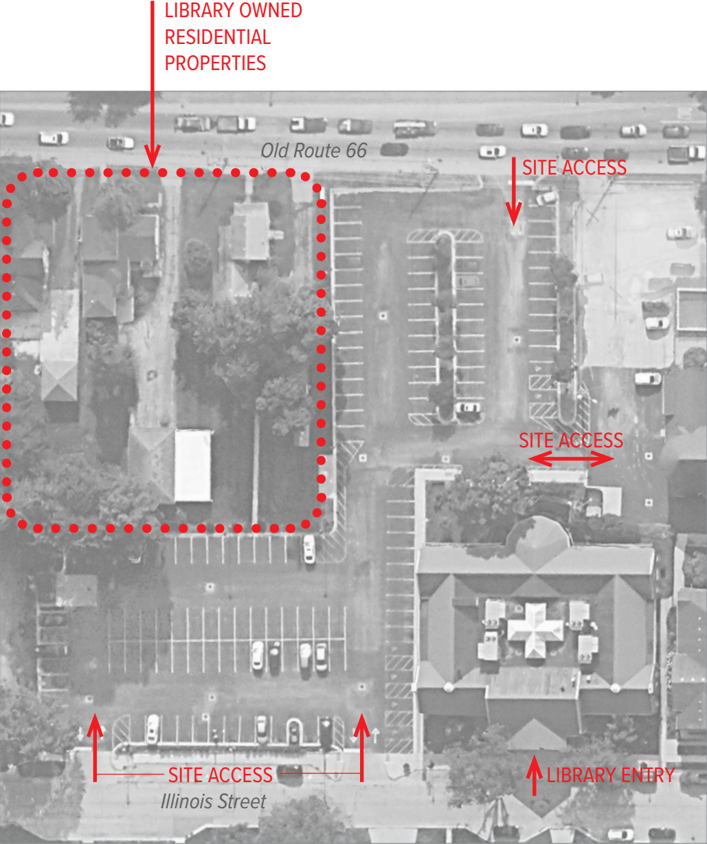
EXISTING SITE PLAN 132 PARKING SPACES