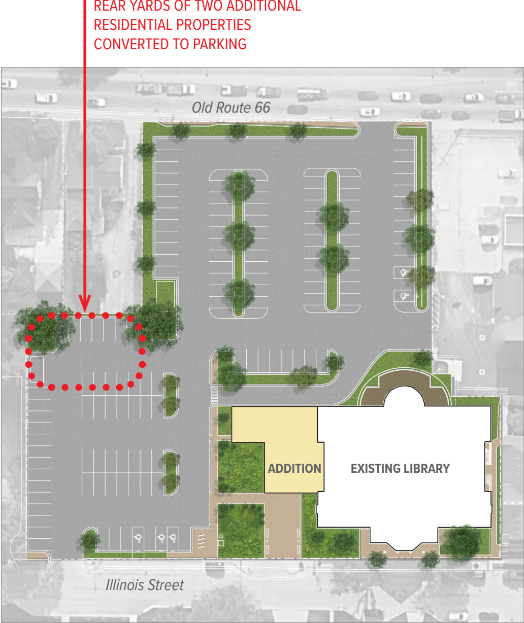
ALTERNATE SITE PLAN 132 PARKING SPACES + $130,000 ($26,400/SPACE)